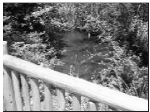
Newly constructed viewing platforms provide a close up view of Lake Creek.

These platforms, placed along the Betsy Johnson Nature Trail , will allow visitors to enjoy a close up view of Lake Creek without damaging fragile creekside vegetation. What might you be looking for in the creek? Salmon of course!