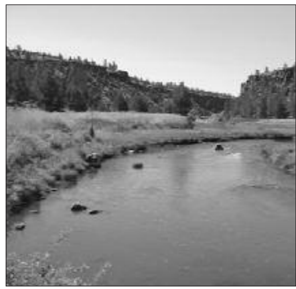
Canyons land protection agreement protects wildlife habitat

Owners of the Ranch at the Canyons came to the Land Trust several years ago hoping to conserve the land they owned on the opposite side of the Crooked River. That land contains more than a mile of Crooked River frontage which will now be conserved for fish and wildlife habitat. The land protection agreement also protects springs and wetlands, raptors, and the area's scenic view.