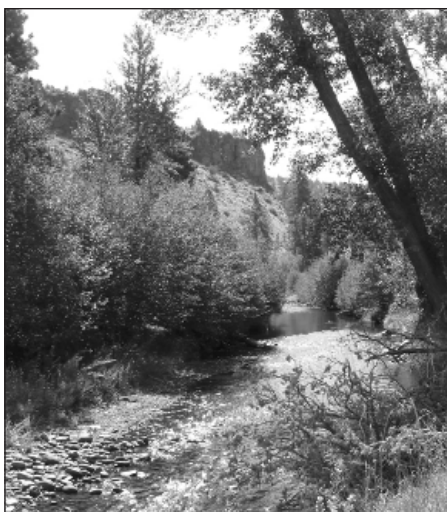
Whychus Creek as it flows through Rimrock Ranch.

The Land Trust is close to completing two conservation projects that will support the reintroduction of salmon and steelhead to the upper Deschutes Basin.