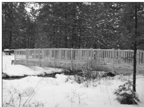
A new log bridge spans the South Fork of Lake Creek.

The old bridges that once spanned the small island in the South Fork of Lake Creek were replaced this winter with new hand peeled log bridges. Two similarly styled viewing platforms are currently being designed and constructed. Also, a color coded trail system for the Preserve was established last fall, so be sure to check out the new trail maps next time you visit the Preserve.