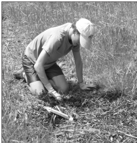
A volunteer helps with trail maintenance at Camp Polk Meadow Preserve.

We hope you'll consider joining us for a 2006 work party. We've scheduled a few early season work parties and others will be scheduled on an as needed basis. A carpool will leave the Land Trust office at 8:30 am and return by 1:30 pm. To register for work parties, please call (541) 330-0017. Dress for the weather and be prepared for off-trail walking. Bring water, snacks and work gloves.