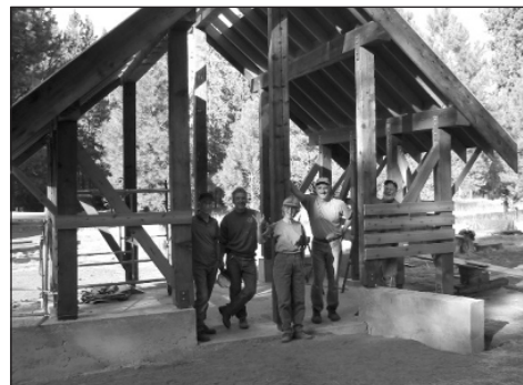
Volunteers take a break from kiosk construction.

Our Land Steward and her many volunteers had their hands full of stewardship activities last fall and winter. Interpretative facilities for the Metolius Preserve are well underway and the new South Fork kiosk is nearly complete. With some final masonry work to come this spring, the kiosk will house interpretative signs that will introduce visitors to the Preserve and our Back to Home Waters program (read about this program on page 3).