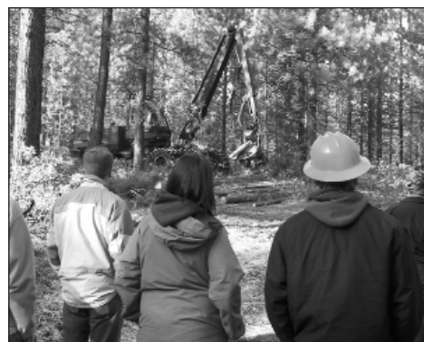
COCC Forestry students take a tour of the forest restoration activities at the Metolius Preserve.

Forest restoration at the Metolius Preserve has been a major focus in recent months. The Land Trust has been working closely with Integrated Resource Management and Scott Melcher's crews to carefully implement the thinning necessary to restore old growth ponderosa pines and wildlife habitat. To minimize soil disturbance, all of the work thus far has been conducted on top of the snowpack and a much healthier forest stand is starting to take shape. With more than 300 acres completed, the Land Trust is looking forward to monitoring the improvements with local students, researchers, and volunteers.