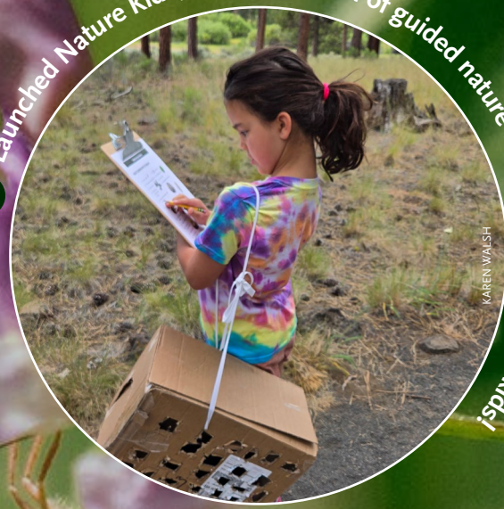
3 Launched Nature Kids, a new program of guided nature walks for families and kids!