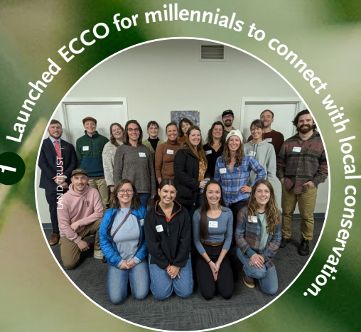
1 Launched ECCO for millennials to connect with local conservation.