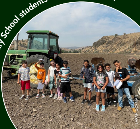
Madras Elementary School students visit Priday Ranch.

We also partnered with Trout Unlimited and Madras Elementary School to provide a tour at Priday Ranch for a group of 4th graders (pictured at right). They toured the ranch, learning about Trout Creek and why creeks are so important in our high desert. Huge thanks to all our partners for the time and energy they put into making these events possible!