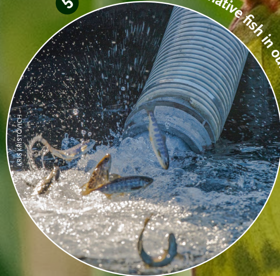
5 Helped reintroduce native fish in our region.