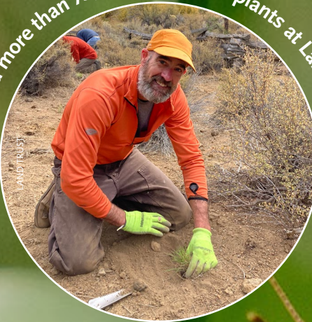
2 Planted more than 75,000 new native plants at Land Trust Preserves.