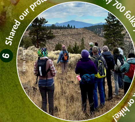
6 Shared our protected lands. Nearly 700 folks joined us on a walk or hike!