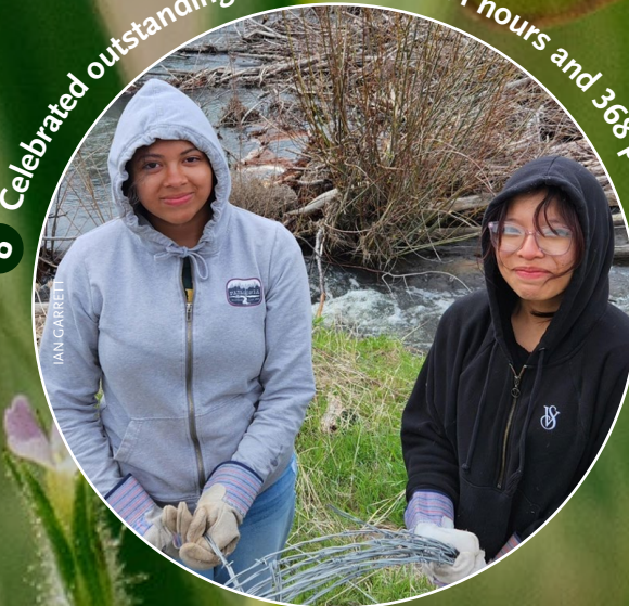
8 Celebrated outstanding volunteers: 5,651 hours and 368 people!