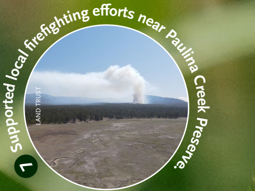
1 Supported local firefighting efforts near Paulina Creek Preserve.