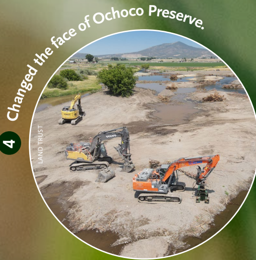
4 Changed the face of Ochoco Preserve.