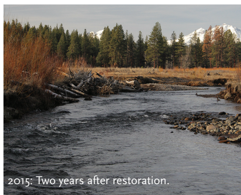
2015: Two years after restoration.