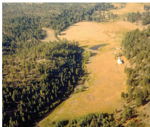
1998: Prior to the Land Trust's acquisition.

It's hard to believe, but it's been six years since the Land Trust and our partners completed the restoration of Whychus Creek and the lower meadow at Camp Polk Meadow Preserve! Since then, the meadow continues to grow and evolve. This summer we revisited some iconic images of the meadow to see how things have changed. Here are a few highlights: