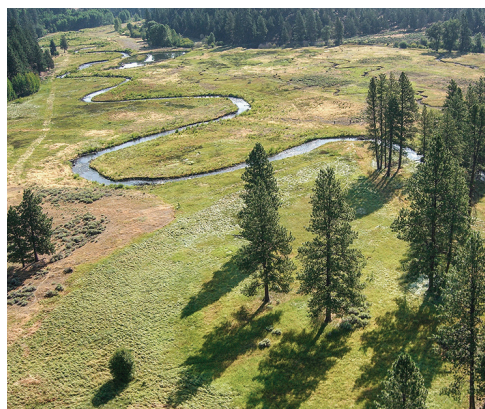
2013: Just after the restoration was completed.