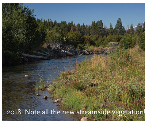
2018: Note all the new streamside vegetation!