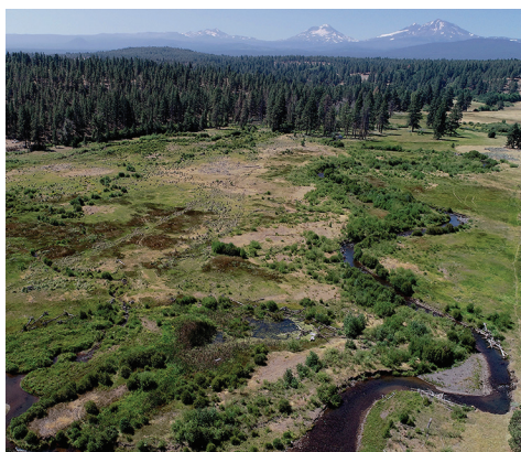
2018: Post restoration.