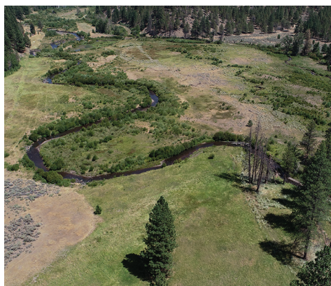
2018: Note all the new streamside vegetation!