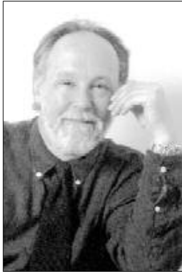
Barry Lopez, author of Light Action in the Caribbean (Vantage Books, October 2001)

“A remarkable opportunity exists to reintroduce and restore anadromous fish to the upper Deschutes Basin.”