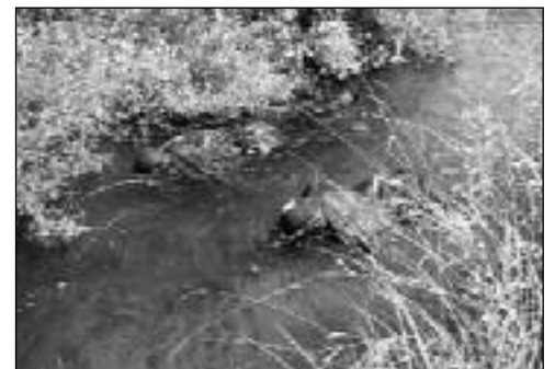
Jens Lovtang and Jeremy Romer snorkeling Lake Creek for spring chinook.

This year, Lovtang released more than twice as many fish as last year (140,000 to 55,000). The increased numbers will allow him to assess whether the fish release design has any influence on distribution. The latest snorkeling surveys on Lake Creek show that fish are both more widely dispersed and present in greater densities than last year -- further evidence that Lake Creek is in fact a "hot spot" for juvenile chinook rearing. For more information on Lovtang's study, go to http://oregonstate.edu/~lovtangj/index.html