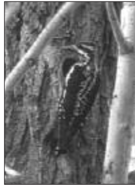
The Red-naped Sapsucker is an annual cavity-nester at Camp Polk Meadow Preserve.