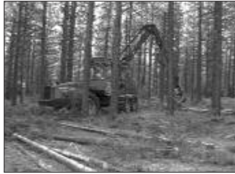
Scott Melcher operates a Harvester to cut small diameter ponderosa pine trees at the demo site.