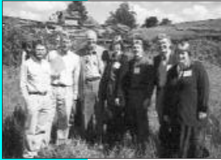
Founders attend the NW Land Trust Alliance Conference.

“...discussions are aimed at keeping Central Oregon’s special character present for future generations.”