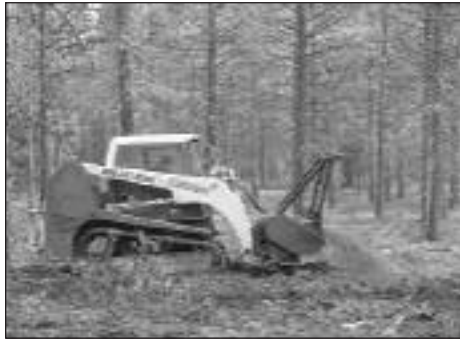
IRM's bio-diesel fueled Lightfoot grinds slash and brush at the demo site.